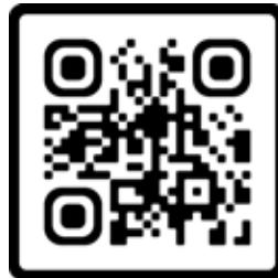
Search for a centre - New Zealand