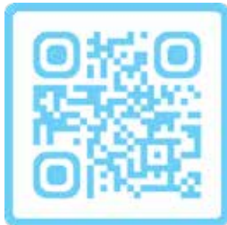
Search for a centre - Australia

Please contact your local Kumon centre for details and to make enrolment arrangements.